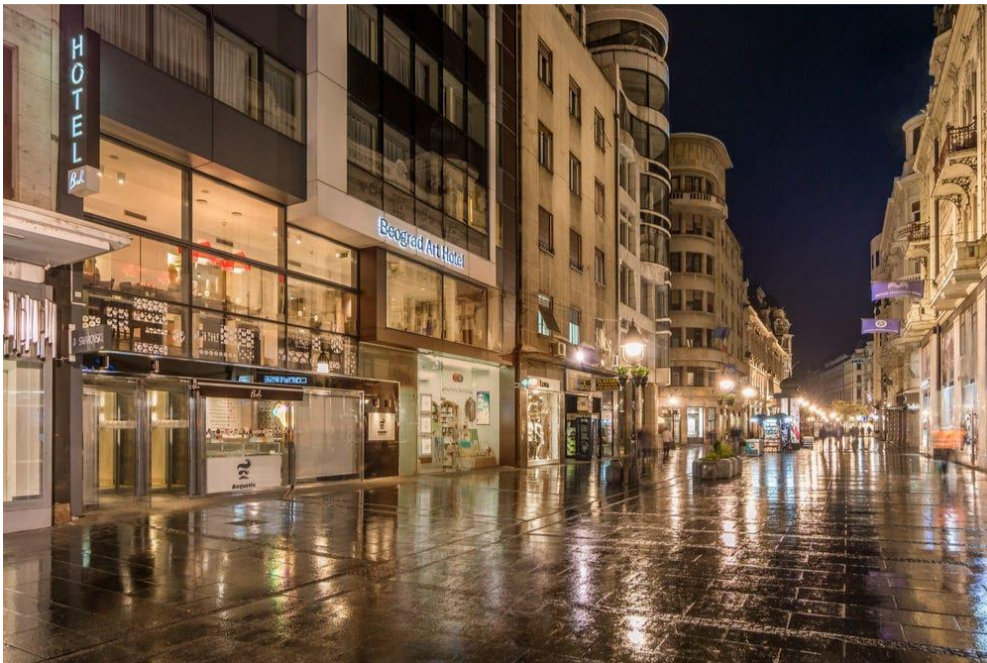
Belgrade Art Hotel